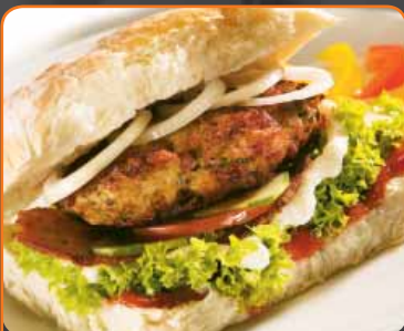
TURKEY BURGER RECIPE INSIDE

Aldi have asked Garth to develop a range of recipes bringing together the best of our local produce and international ranges. Look out for the pull-out recipes in our leaflet each fortnight – collect them all and you'll have an affordable, inspiring idea for every occasion.