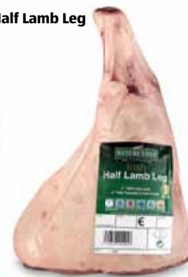
Irish Half Lamb Leg