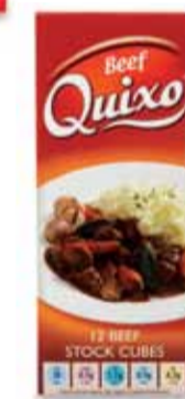
Beef Stock Cubes